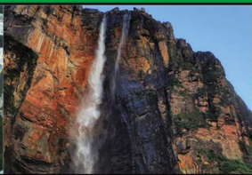
Angel Falls, Venezuela