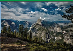
Yosemite Valley, California