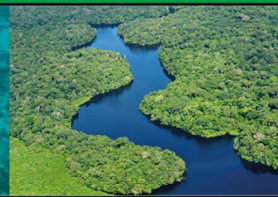
Amazon Rainforest, Brazil

Great Blue Hole - Belize by Larry Malvin is licensed under CC BY 2.0