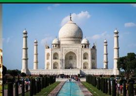
Taj Mahal, India