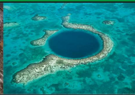
Great Blue Hole, Belize