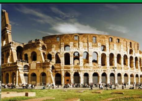
The Colosseum, Italy