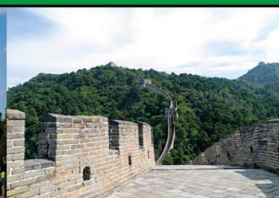
The Great Wall of China