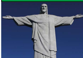
Christ the Redeemer, Brazil