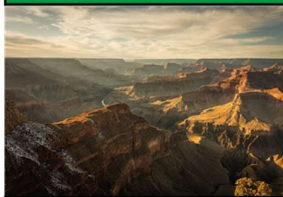
Grand Canyon, Arizona