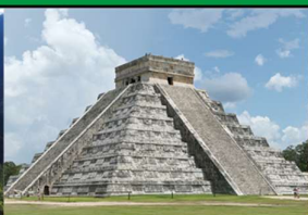
Chichen Itza, Mexico