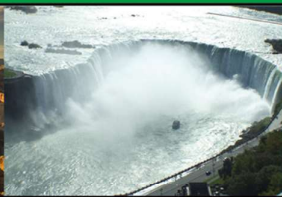
Niagara Falls, Ontario/New York